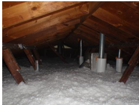
Before (top) and after (bottom) images of an attic space that has been sprayed with foam insulation. This is just one of several CARPDC Weatherization Department