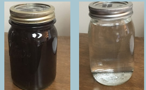
Before (left) and after (right) images of water samples taken from the Town of Billingsley Water System.